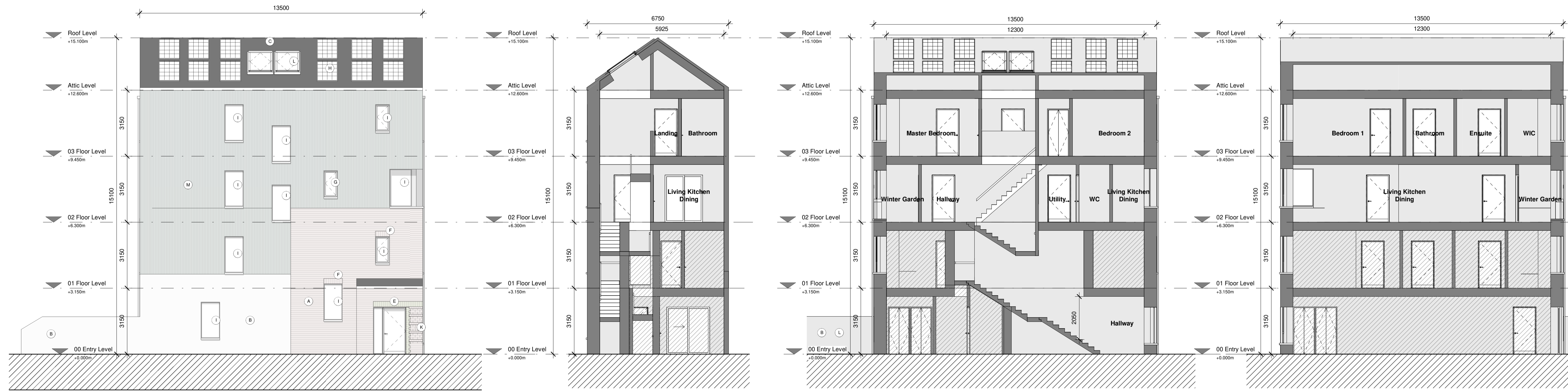
7 Gable Elevation 1 : 100

Based on the 'Sustainable Urban Housing: Design Standards for Apartments' (2020)